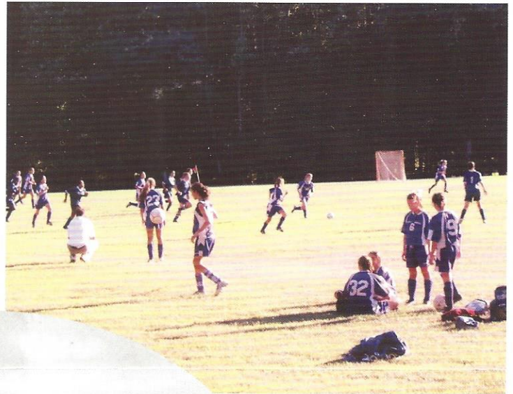
MEADOW RIDGE PARK

Pre-1920 view of the site of Victory Park