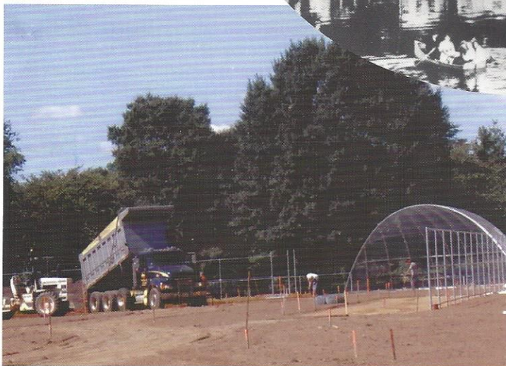
RIVERSIDE PARK (UNDER CONSTRUCTION)