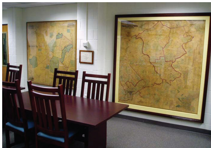
The Jane G. Clayton Research Room at the Archives Division

Monmouth County is home to many historic sites and properties, which are preserved and restored to educate the public about the county's ancestry. This past July, T. Thomas Fortune's house in Red Bank was saved from demolition and approved by the borough's zoning board to be restored. Historic homes such as the T. Thomas Fortune House or private properties such as your home can be researched at the Monmouth County Clerk's facilities.